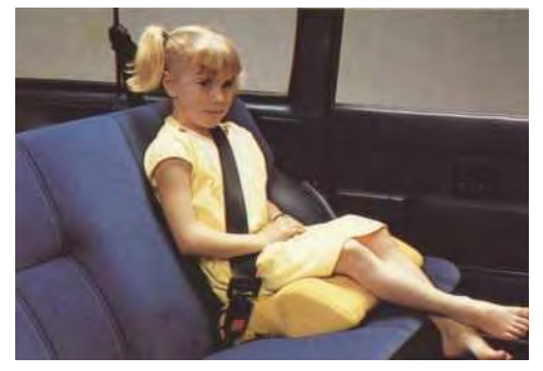
3. Your Volvo dealer would be only too happy to tell you more about child-safety features and accessories.