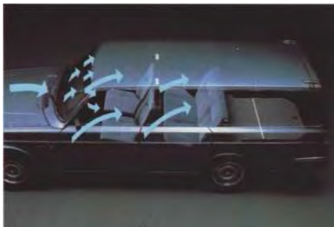
1.14 inlets make for an abundant availability of ventilation.