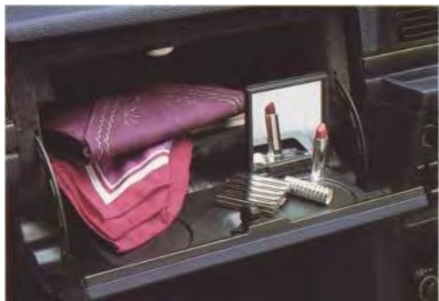
2. The illuminated glove compartment with a "table" and vanity mirror is just one of a Volvo Estate car's numerous storage compartments.